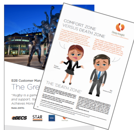
Full Page in workbook