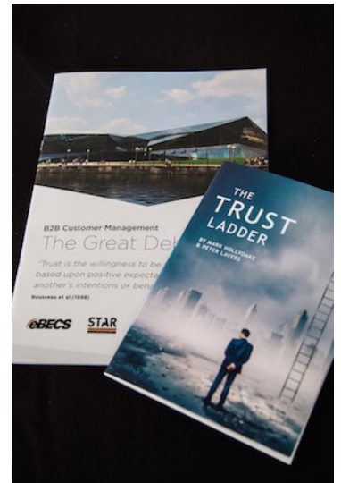
Brochure and Co-branded Book